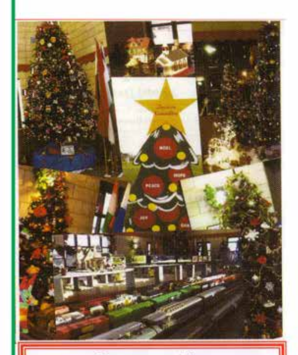
Sponsored by Lorain Growth Corporation Tourism Committee Lorain Port Authority