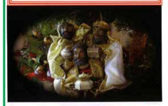
Join the fun and enjoyment of the Christmas Season.