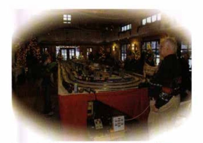
Black River Transportation Center 421 Black River Lane Lorain, Ohio 44052